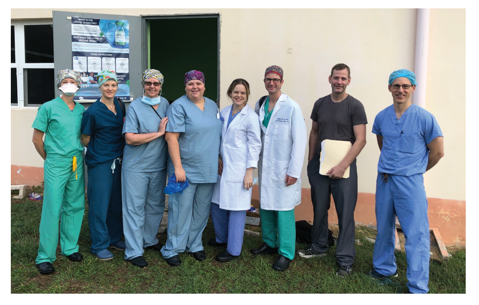
Figure 3. Surgical team during November 2021 surgical trip to Belize.