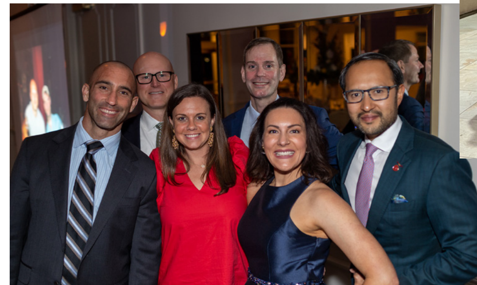
GSE Board of Directors enjoying a wonderful night.