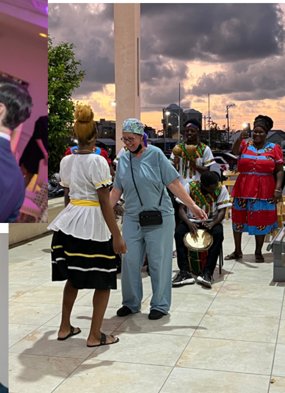
More dancing to be had in Belize City. This is our fall team celebrating with dancing and drums.