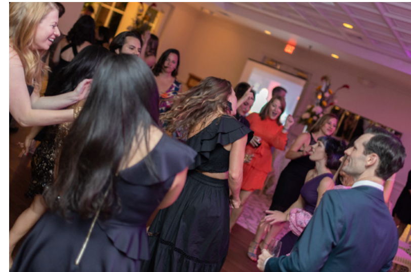
Dancing the night away at our 2022 gala.

Save the date and join us on November 11, 2023 for this year's Gala.