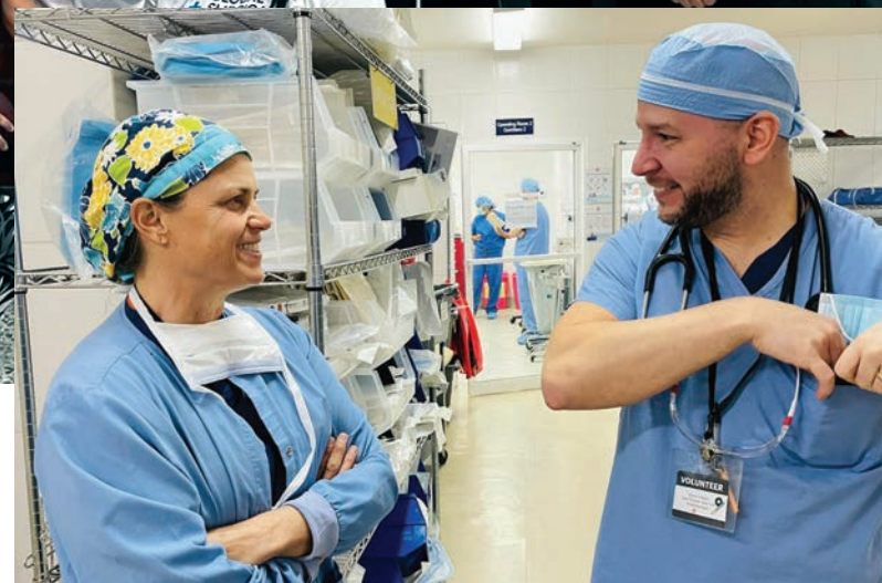
Anesthesia team in Honduras discussing the cases for the day.