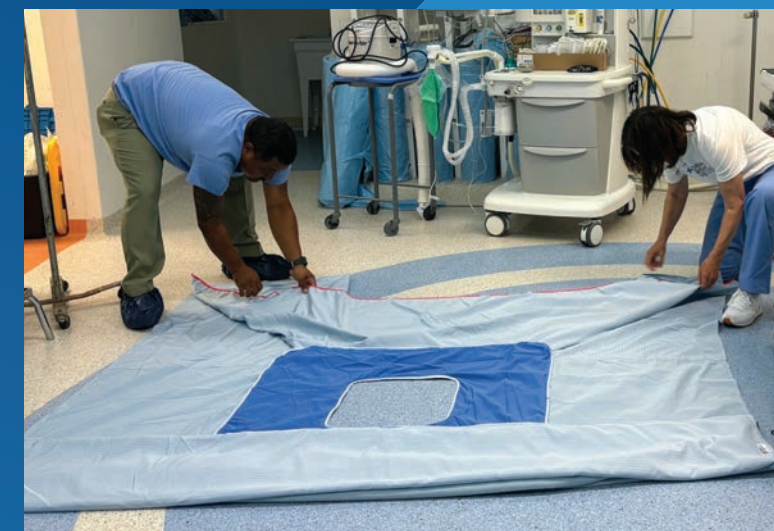
Team GSE preparing our reusable surgical drapes to decrease the environmental impact of disposable drapes.

That includes seeking partnerships to implement reusable surgical drapes, cutting down on the waste created by disposable alternatives. Here's a picture of our team organizing our reusable drape system for surgery - a