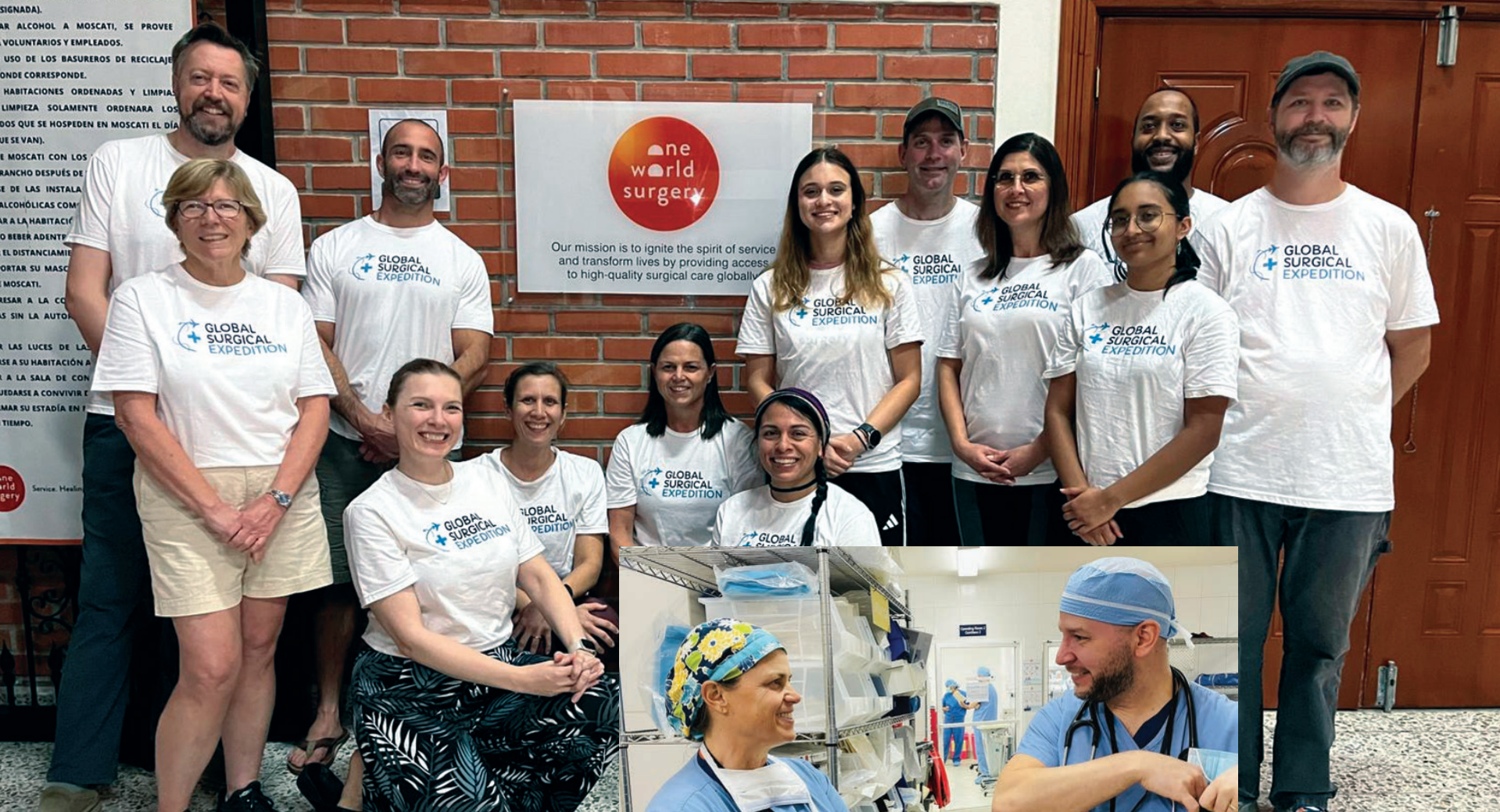
Team GSE in Honduras in collaboration with One World Surgery.